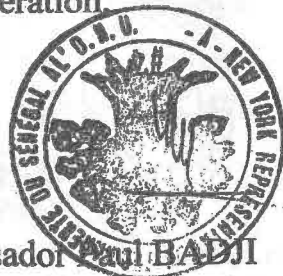
Ambassador Paul BADI Permanent Representative of the Republic of Senegal to the United Nations

We take this opportunity to renew to Your Excellency, the assurances of our highest consideration