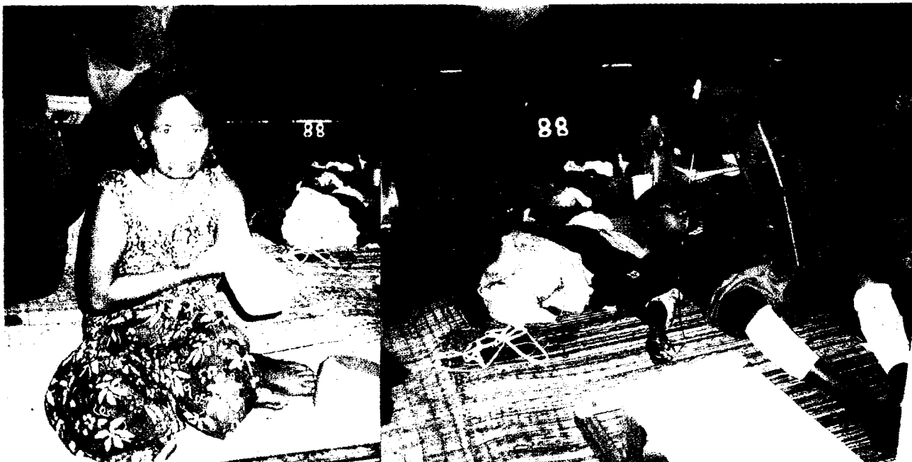
Mostly women and children under the age of 12 years old.