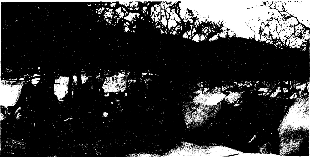
Temporary site for refugees from Dangrek camp: ... scorching heat of the days and relative cold of the nights of the Dangrek mountain range only a few hundred metres away (in background).

The attack against Dangrek represents yet another episode in the escalation of violence and atrocities by Vietnamese occupation forces against the Cambodian people. It forced all 23,000 civilian inhabitants of the camp into Thailand, thus adding further suffering on the hapless refugees, not to mention the extra load imposed upon the already heavy refugee burden of the Royal Government of Thailand. By sending them away from their homes in Dangrek, the Vietnamese purposely wanted to deprive them of what little comfort left to them in a long time and threw them back once again defenceless against the scorching heat of the days and relative cold of the nights of the Dangrek mountain range only a few hundred metres away.