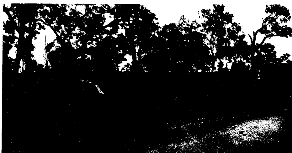
Dangrek, a peaceful settlement where a semblance of normalcy prevailed. This picture shows a group of Buddhist monks on their way to the village.

In many respects, Dangrek camp had somehow become a model for other refugee camps along the Thai-Cambodian border.