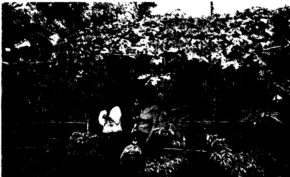
...each family in the camp grew its own vegetables...