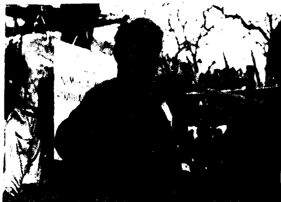
A survivor: "No warning..."

The shells hit camp districts Nos. 2, 3, 7, and 8 exclusively. According to the list of casualties submitted by camp leader Chum Chheang, of the 15 people killed, only 3 were adult males: a young man of 22 and two older people in their fifties. The others were either women or children under the age of 12.