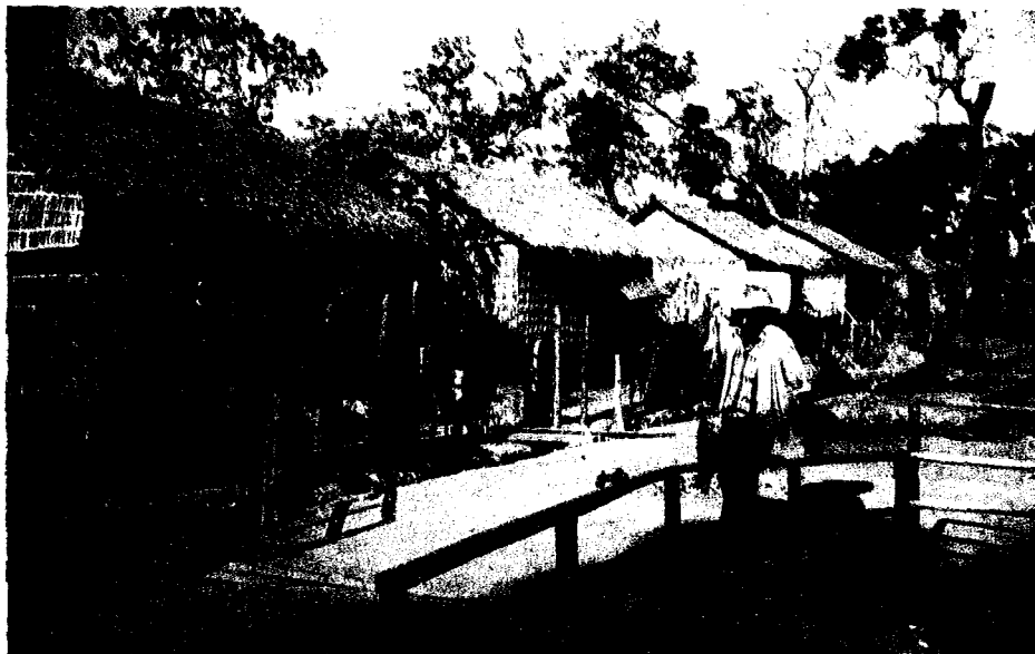
Dangrek camp: ... a model for other refugee settlements along the Thai-Cambodian border.