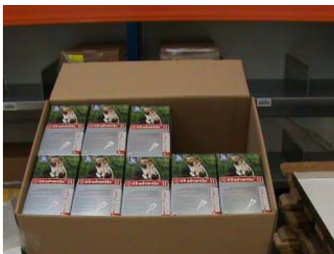
Picture 2: Filled with inner packages, which are wetted with a total amount 1.920 ml (after the last injection)