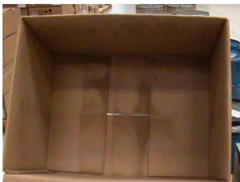
Picture 4: View inside the outer package after removing the inner packages (960 min after wetting package):