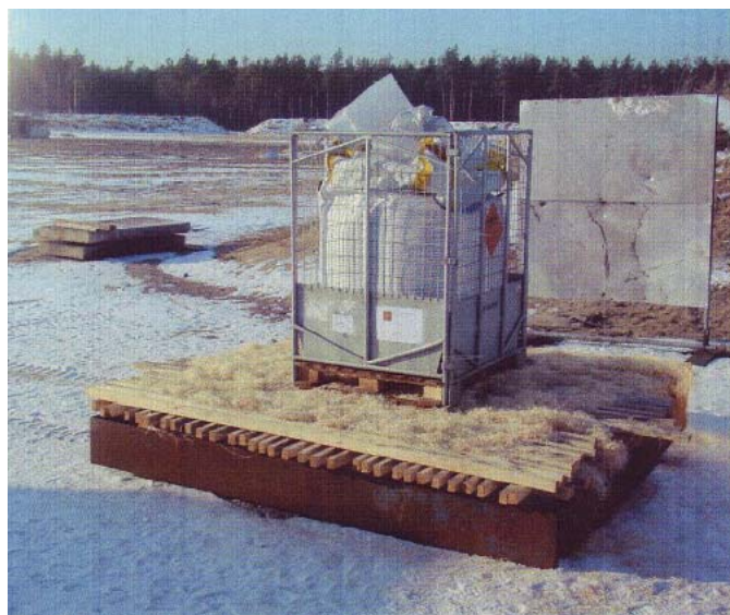
Figure 1 Test set-up

The test was carried out on 17 January 2006 at BAM's open-air facility in Horstwalde under dry conditions at temperatures of -6 °C to -4 °C and wind speeds of 0 m/s to 2 m/s.