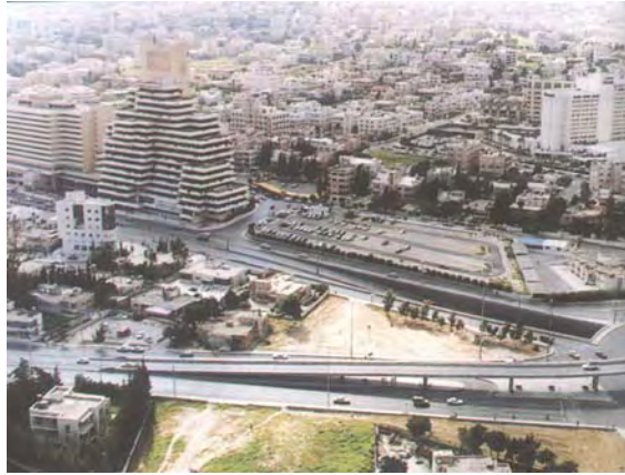
Figure 3. Aerial view showing parts of the Shmeisani district