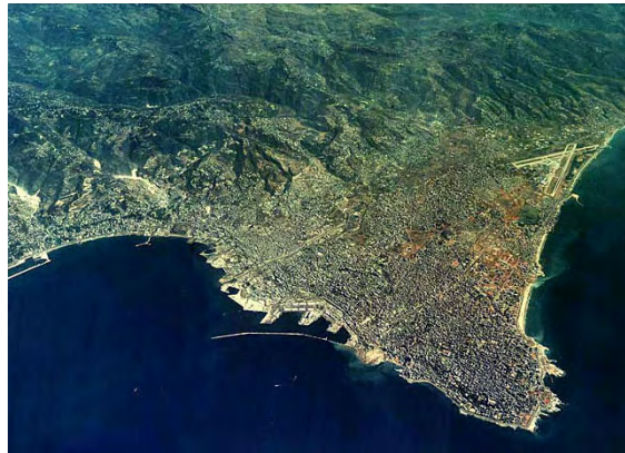
Figure 8. Aerial view of Beirut

For the purposes of this study, an Arab city is one that exists in an Arab country and that is inhabited by an Arabic-speaking population. Using such a definition, Beirut is an Arab city. However, the imprint of Arab and Islamic urban culture on Beirut is less evident than on Cairo, Aleppo or, for that matter, on such Lebanese cities as Tripoli or Sidon. Beirut has been continuously inhabited since the third millennium B.C.; and the city's heritage testifies to a variety of influences to which Beirut was subjected, including, among others, Phoenician, Persian, Hellenistic, Roman, Byzantine, Crusader, Mamluk, Ottoman and French under the mandate and leading to independence in 1943.