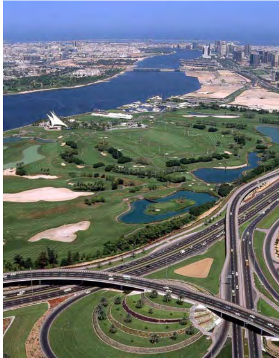
Figure 21. View of the Garhoud Interchange in the foreground and the Emirates Golf Club in the background