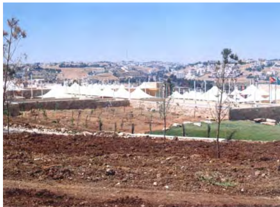
Figure 5. View of Al Hussein Public Parks showing the “Culture Village” in the foreground

Al Hussein Public Parks occupies a site of 70 hectares located at the western edge of Amman. It includes various landscaped areas, theme gardens, recreational facilities, museums and cultural buildings. The project, which has not yet been completed, is by far the largest urban park in Jordan.