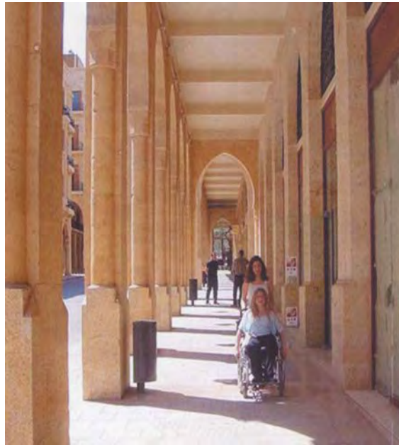
Figure 15. Accessibility for the disabled

Outside the perimeter of BCD, the scarcity of trees and greenery in the public domain is tempered only by private gardens and potted plants on the balconies and terraces of buildings.