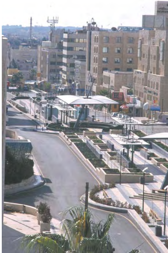
Figure 6. View of the Culture Avenue