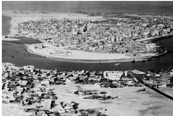
Figure 19. View of Dubai Creek in 1945

A master plan for Dubai was commissioned in the late 1950s with the aim of developing a rational grid layout of new blocks to guide expansion outside the old city. Under this plan, buildings were restricted to five storeys. While this restriction was not always strictly adhered to, it did instigate “the establishment of the municipality council to help implement public services and to control building development”. 44 The first bridge across Dubai Creek was constructed in the early 1960s following serious dredging undertakings that made the Creek accessible to larger ships. Most of the early urban development and business occurred on the northwestern side of the Creek around the district of Deira. However, since the construction of the Maktoum Bridge and following the creation of the United Arab Emirates and the increasing trade with Abu Dhabi, Dubai has expanded primarily towards the east.