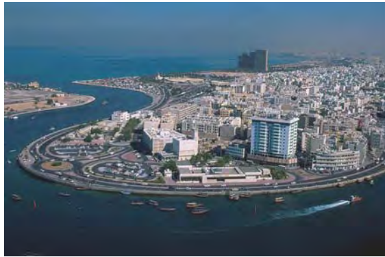
Figure 20. View of Dubai Creek in 1995

The logic of development through isolated projects tends to overshadow any urban process of planning in Dubai. The city enjoys a strong partnership model between the Government and the private sector. This translates into a risk-sharing strategy whereby the Government usually takes the initiative of sponsoring and promoting large projects that the private sector would not otherwise undertake. 45 These pioneering large developments are linked to a broad spectrum of sectors and industries, including manufacturing, health, transportation, tourism and leisure. Importantly and in addition to gaining the full support from the Government, these projects are generally implemented in a timely manner such that they garner an initial financial success and increase the receptiveness of investors. This rapid implementation of projects, from conception to full execution, is among the fastest in the world and can be largely attributed to a minimal bureaucracy related to development.