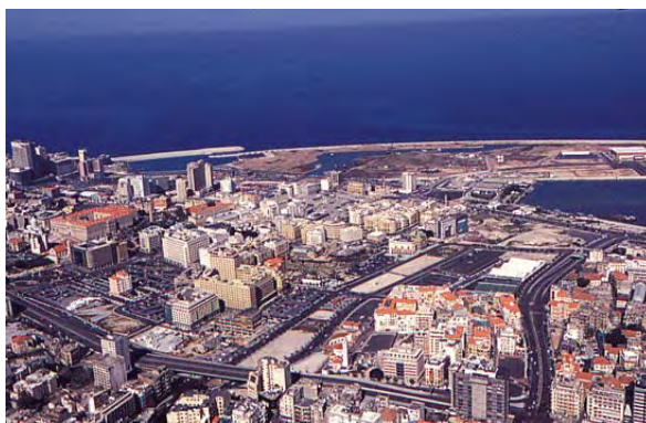
Figure 10. Aerial view of Beirut Central District

namely, SOLIDERE, was established to develop the city centre. 28 This company, capitalized partly by cash subscriptions from investors and partly by issuing shares, expropriated the central district perimeter. 29 In retrospect, it is clear that the reconstruction plan should have preserved the rights of the original property owners. Rebuilt as a collective effort, the city centre would then have attracted residents and involved individuals, not merely visitors. More importantly and despite the confessional composition of the board of SOLIDERE, which follows the consensual pattern of the Government, the development of BCD failed to provide the city and the country with the promised civic space of healing and recovery.