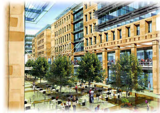
Figure 7. Artist's rendering of a pedestrian zone in the 'Abdali regeneration project