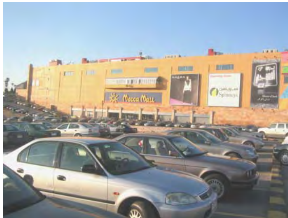
Figure 2. View of one of Amman's latest shopping malls

The changes initiated during the 1990s are still unfolding. The telecommunications revolution continues at a strong rate. In addition to the spread of the Internet, mobile telephones are becoming highly widespread. While the service began to be offered in 1995, prices remained prohibitively high for a number of years. However, since 2000, especially with the entry of a second mobile telephone provider, prices for mobile services have gone down considerably, and the number of users has consequently risen sharply with a penetration rate in Jordan currently approaching 25 per cent. 16 This rise in the use of mobile phones in the country has had a liberating affect on the manner in which people carry out various social and business transactions.