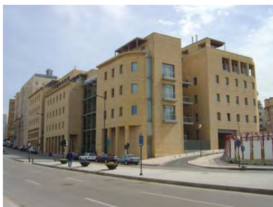
Figure 16. Banque Audi headquarters