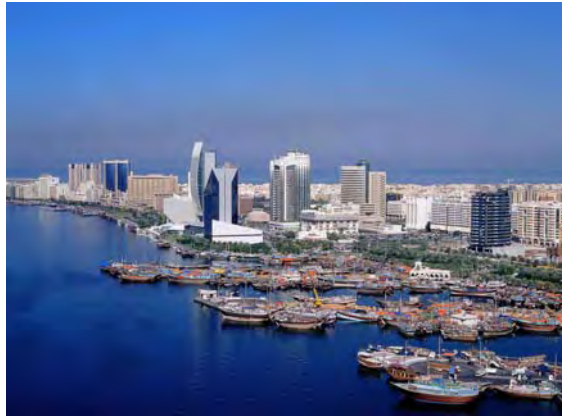
Figure 22. View of the old port in the foreground and the Bani Yas district in the background

The “cities” within Dubai are divided according to their specific functions and programmes, and incorporate scales that range from super blocks to land-use zones. These many cities include, inter alia, the Dubai Healthcare City, which aims to become the medical hub of the region by attracting several medical research institutions from across the world and by incorporating hospitals, clinics and special treatment centres; and the Academic City, which aims to attract higher educational institutions to the area. These cities underscore Dubai’s drive to attract high-skilled professionals from such diverse fields as healthcare, information technology and finance.