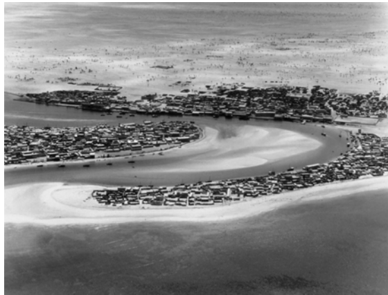
Figure 18. View of Dubai Creek in 1937