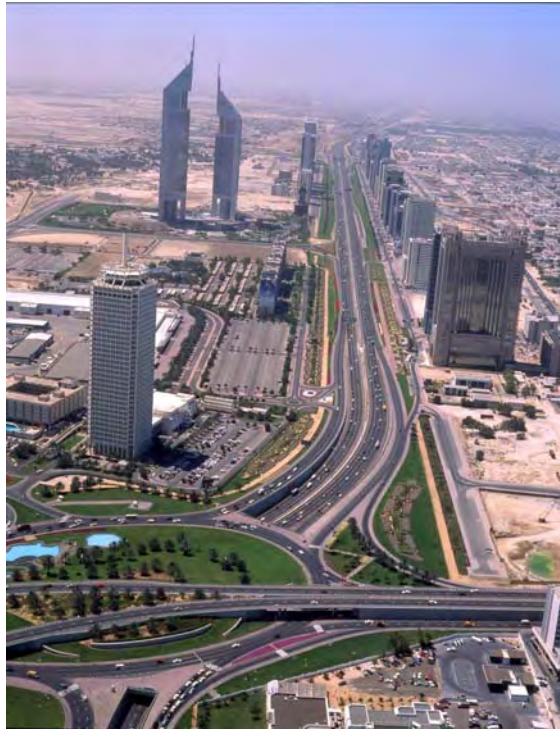
Figure 24. View of the Trade-centre Interchange in the foreground and Sheikh Zayed Road in the background

The evolution of the architecture in Dubai attests to the strong impact of the project approach on the city's skyline. The architecture of the early independence and oil boom years maintained a scale and distribution that allowed for a multi-centric city to emerge. The concentration of buildings around Deira and Dubai Creek still maintains a mid-rise scale with an architectural language that blends some of the international modernism of the 1970s with Arabesque iconographies, integrated within an overall modernist framework. The main projects were commissioned to foreign architects, primarily British firms, to provide a sense of continuity with the pre-independence era.