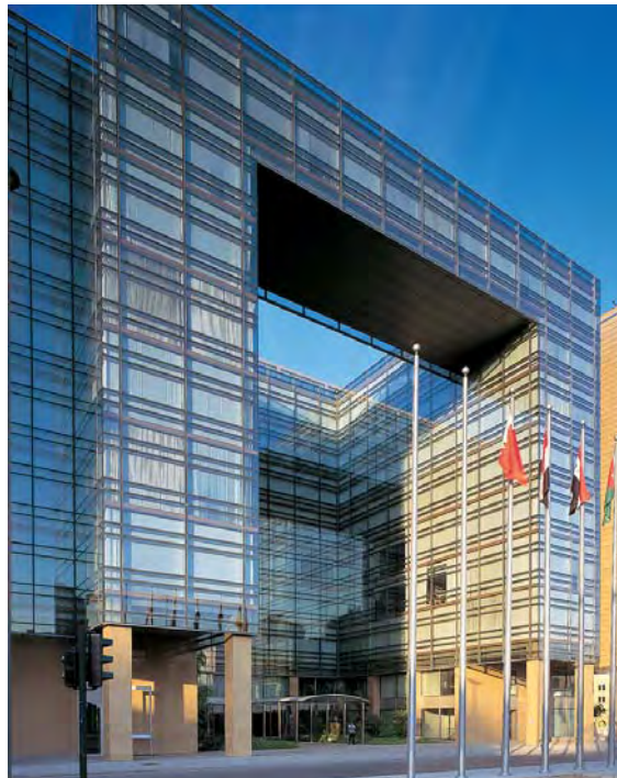
Figure 11. The United Nations House

The United Nations House, which is the headquarters of ESCWA, was completed in 1997 and designed as a paragon of Lebanon's recovery. On its eastern and western sides, the building presents conventional alternating strips of polished granite and glass; and the core of the building is a U-shaped glass box facing a public garden and, beyond that, the highway to the airport. While the glass walls provide the building with a high-tech futuristic look, the design proved inappropriate given the exposure to the heat and glare of the sun.