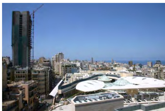
Figure 14. The ABC Mall in Ashrafieh and neighbouring tower