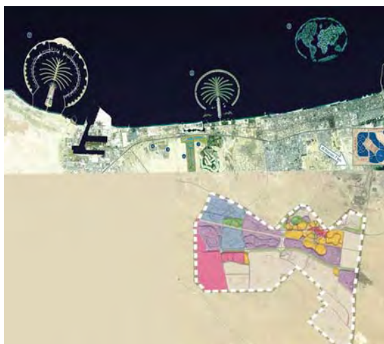
Figure 23. Rendition of an aerial view of future Dubai