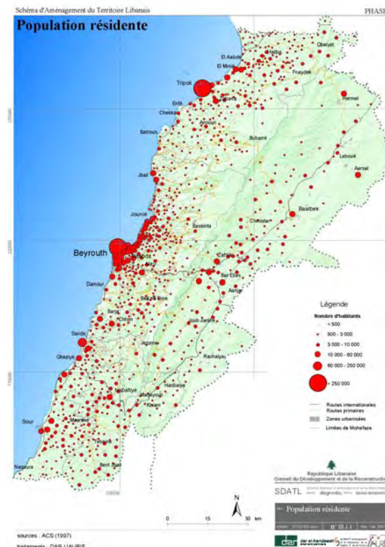
Figure 17. Population map of Lebanon