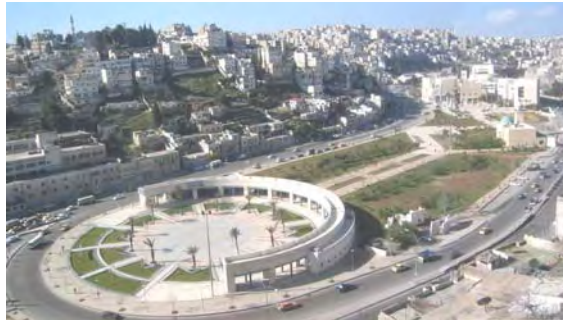
Figure 4. View of the Ras Al Ain municipal complex

constructing a number of important public and cultural buildings, including the Amman City Hall, which is set to incorporate exhibition and lecture halls, and offices of the mayor and high-level municipal staff; the administrative municipality building connected to the City Hall by way of a bridge; Al Hussein Cultural Centre with lecture halls, a library and artist studios; a mosque; the Jordan National Museum; and an open, landscaped area to function as an urban public park.