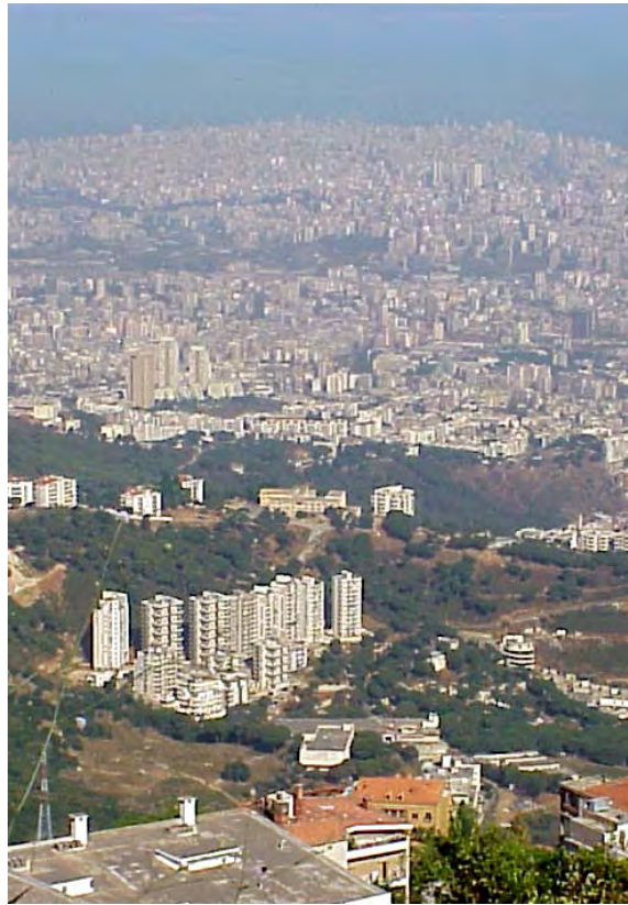
Figure 9. View showing the buildings overlooking Beirut