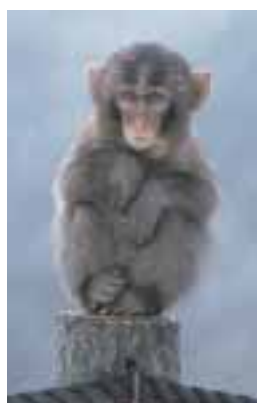
Protected areas are home to a myriad of species.

Successful development depends upon sustainable management. One of the biggest challenges we face in this new century is to protect and conserve our lands and the species that inhabit them, so that our resources last as long as our green spaces. Our work on protected areas, World Heritage sites and species made an outstanding contribution in 2003.