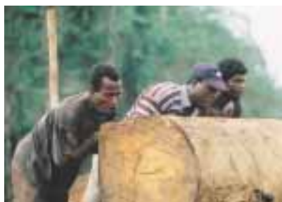
Unsustainable levels of felling poses a threat to tropical tree species.

The Centre's Mangroves of East Africa report, released in the first half of 2003, focused on factors and activities that affect mangroves across East Africa. A series of case studies from South Africa, Mozambique, Madagascar, Tanzania, the Seychelles, Kenya and Somalia highlight the value and vulnerability of these ecosystems. Mangroves bridge the gap between forests and oceans - situated on coastlines, they prevent coastal erosion as well as providing timber, fuel and food to the growing East African population.