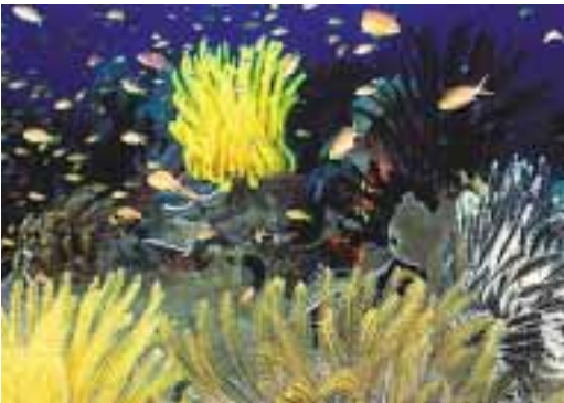
Coral reefs harbour fish and encourage tourism.

Our most precious resource, water quenches our thirst, supplies our food and ensures basic sanitation.