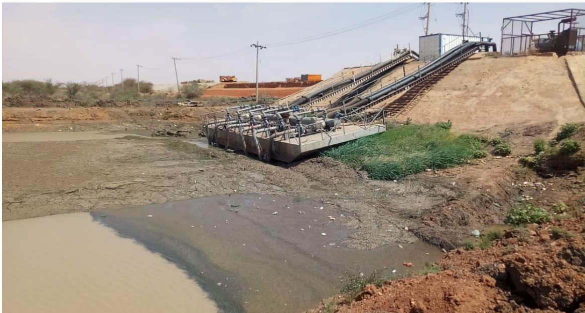
Figure (2): River receding images in front of El Salha Water Plant, captured on July 20, 2020

It is to be reaffirmed that, the unilateral filling of the GERD is against the international law, and against the principles set in the DOP, which may seriously affect the people of Sudan. It is also against the request of the AU led process “ Parties to refrain from unilateral actions ”.