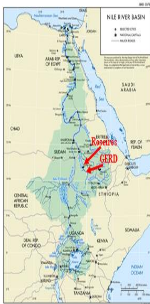
Fig. 1: Map of the Nile Basin