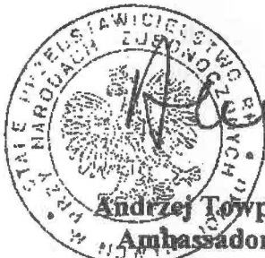
Andrzej Tompik Andrzej Tompik Ambassador

Please accept, Excellency, the assurances of our highest consideration.