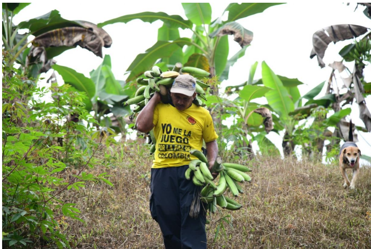
Colombia: In Tumaco-Nariño, southwestern Colombia, nearly 80 former combatants are growing pineapple, aloe, plantain, and lemon as part of their reintegration process.

In Colombia, attacks against former FARC-EP combatants have persisted, requiring strengthened prevention and investigation of incidents, as well as more fluid information-sharing on the provisions in the Peace Agreement that guarantee the security of former combatants. The United Nations Verification Mission in Colombia, with MYA funds, established a dedicated liaison capacity, based in areas with pressing security challenges, to support the Special Investigations Unit of the Attorney General's Office with contextual security analysis. This expertise also helps to identify the main risks faced by former FARC-EP combatants and proposes gender-differentiated prevention and protection strategies. These efforts contributed to enhance trust between former combatants and state institutions in charge of prevention, protection and investigation of violence against former combatants by making existing tripartite arrangements involving the Special Investigations Unit, the Verification Mission and FARC representatives more effective and sustained.