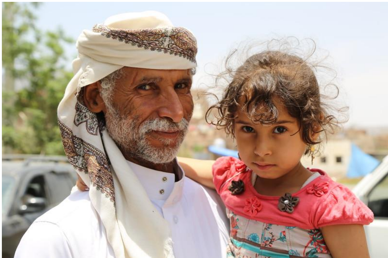
Yemen: Father and daughter, living with dozens of other IDPs in Sana'a, Yemen.

The session generated an action plan to elevate commitments to further promote women's participation and the integration of gender perspectives throughout the multi-track process. While the UN currently cannot host in-person meetings between Yemeni stakeholders due to COVID-19-related restrictions, OSESGY is conducting virtual meetings which offer possibilities for broadening participation and improving inclusion. In mid-June, the Office convened a virtual meeting focused on a gender-inclusive ceasefire and community safety. More than 20 Yemeni women participated in the virtual consultation. Nearly three-quarters of the participants came from inside Yemen, including over 40 per cent from the south, and young women comprised 23 per cent.