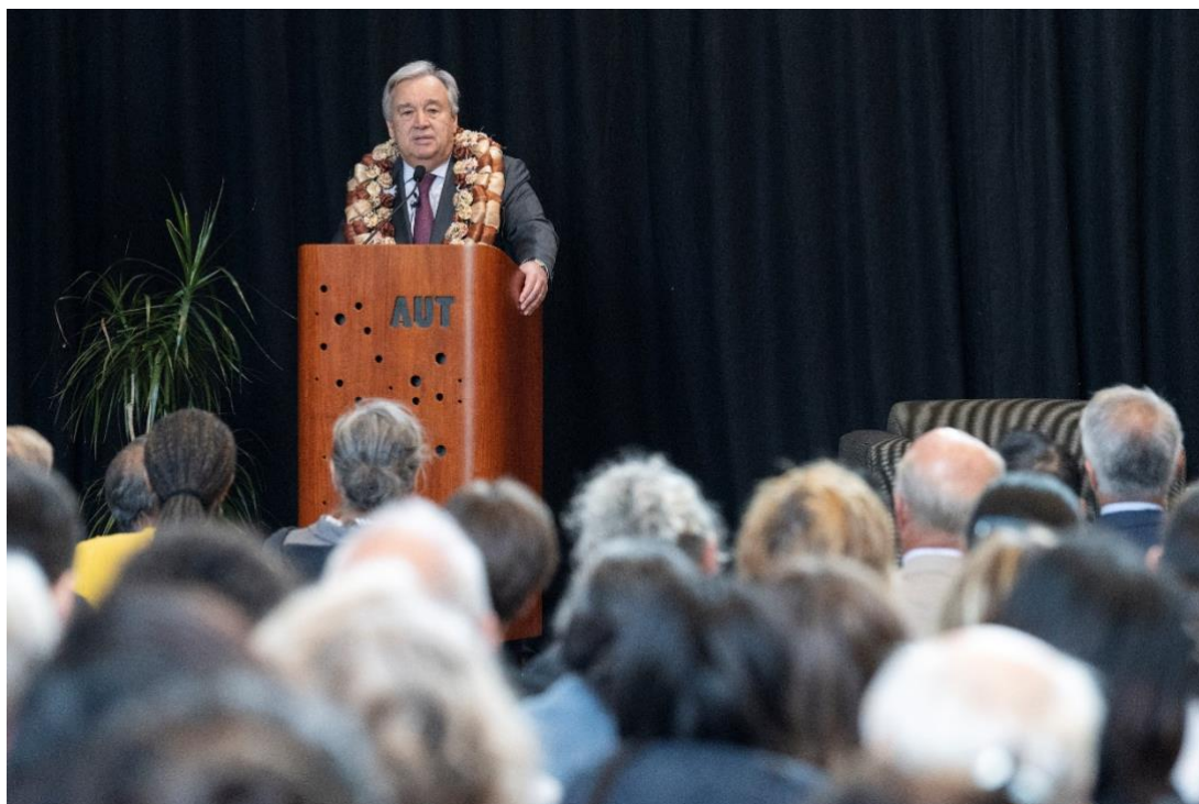
Secretary-General António Guterres makes remarks to students at the Auckland University of Technology, about the need to defeat climate change and ensure that technology is used as a force for good.

The active engagement with partners enabled DPPA to contribute a climate security perspective to several reports of the Secretary-General during the reporting period, including on West Africa and the Sahel; the global state of peace and security; and the protection of civilians. MYA funds were also used to advance targeted research and strengthen the knowledge based on climate-related security risks. To this end, DPPA commissioned a multidimensional study of climate risks in the Middle East and North Africa that analyzed the interactions between climate change and social, political, economic and demographic factors, and provided recommendations to strengthen the ability of the UN to prevent conflict and sustain peace in the region.