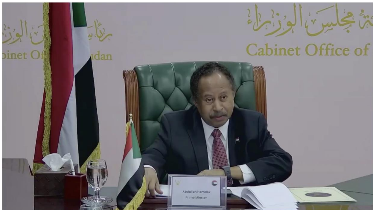
Sudan: Sudanese Prime Minister Abdallah Hamdok during the high-level partnership conference on 25 June to support Sudan's economic reforms and mitigate their social impact on its population.

As part of its coordination with the strategic communications and public information offices of SPMs, DPPA's communications team highlighted the work carried out by field missions to respond to the pandemic. Internal communications, including colleagues from the Department of Peace Operations as part of the shared regional structure, also remains a priority as staff continue to work from home.