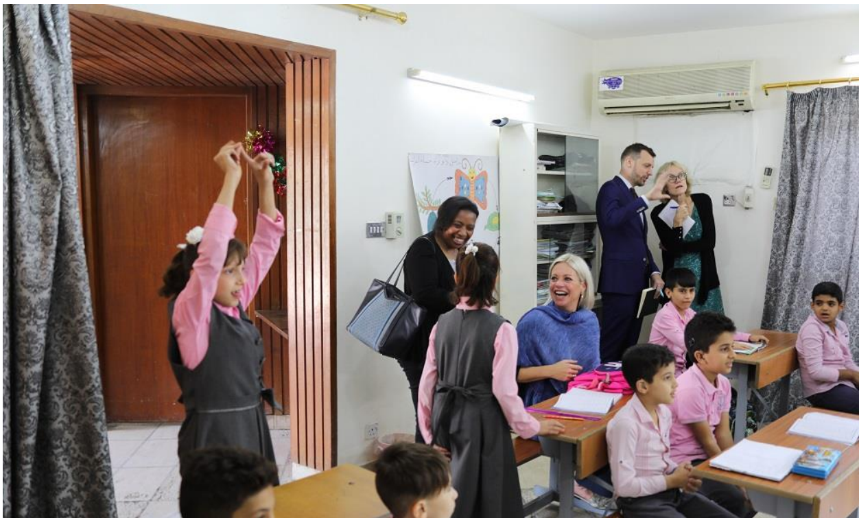
Baghdad, Iraq: The Special Representative of the United Nations Secretary-General for Iraq, Ms. Jeanine Hennis-Plasschaert, visited Ayatollah Hussein al-Sadr's schools for deaf and blind children.

Following the establishment of the Women Advisory Group (WAG) for Iraq in October 2018, UNAMI and the international community have increased engagement with the Government of Iraq to promote women's political participation and advocate around the needs of women IDPs. During the reporting period, UNAMI developed a training manual to address leadership skills, advocacy, participation in public life, and other topics. UNAMI's implementing partner in this project, the Free Iraq Foundation, held a two-day virtual training-of-trainers on 23-24 June in preparation for the planned training of 45 women from five governorates. A key result of the project is a deepening understanding of the challenges and needs facing women entering politics and women already politically active.