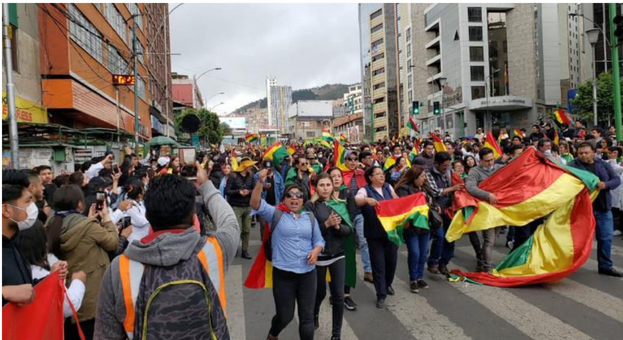
Bolivia: Demonstrators protest in the streets of La Paz, Bolivia.

For example, in Bolivia, elections that were expected to take place in May 2020 have now been delayed to the second half of the year. With MYA funding, DPPA is supporting virtual multi-party dialogues to prevent conflict and create an environment conducive to carrying out an inclusive, participatory and credible electoral process, including in the run-up to election day. The multi-party dialogues bring together electoral authorities and members of political parties and civil society to assist in clarifying queries. Over 50 dialogues had been held by July 2020, focusing on youth, elections, and the pandemic. The events have created awareness among the electorate, brought various actors/parties closer together, and contributed to the de-escalation of conflict and a possible peaceful resolution through the elections.