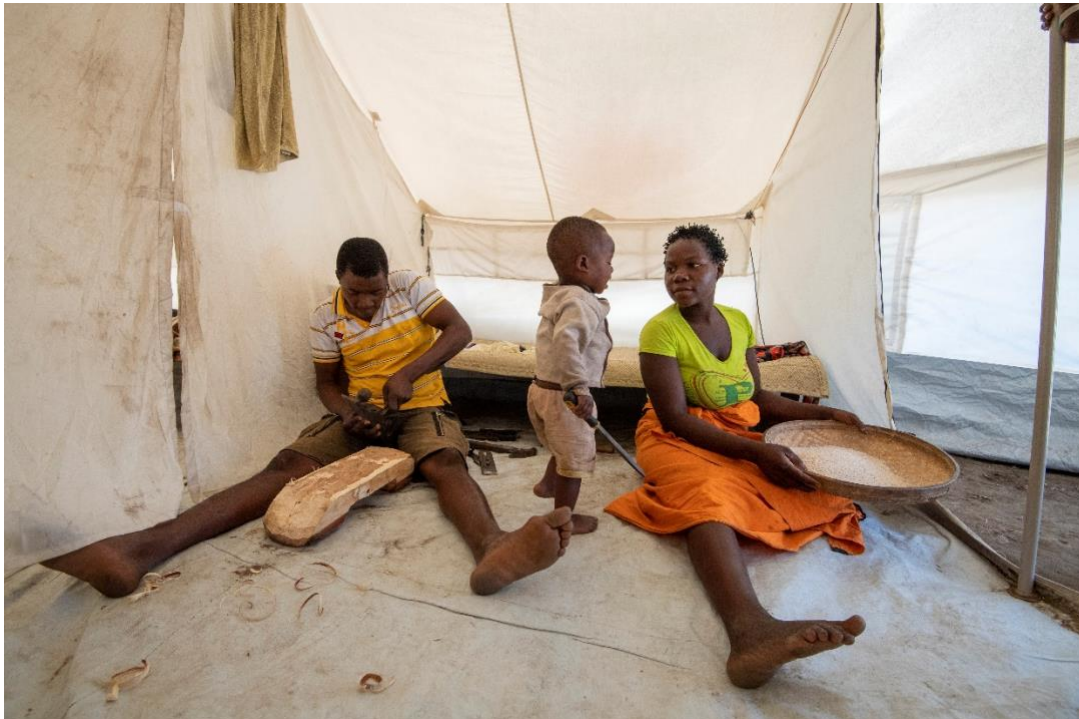
Mozambique: Family in their tent in the Taratara Camp, in Cabo Delgado province after Cyclones Idai and Kenneth.

In the second quarter, and due to COVID-19 and related travel restrictions, the Mediation Support Unit (MSU) provided remote operational support on mediation and dialogue initiatives to Special Envoys, peacekeeping operations, special political missions, resident coordinators, regional organizations and other partners, mobilizing its staff as well as the mechanism of the Standby Team of Senior Mediation Advisers. Remote operational support was provided in various settings, including Afghanistan, Costa Rica, Cyprus, Ecuador, Geneva International Discussions, Guatemala, Guinea, Libya, Mozambique, Papua New Guinea, South Sudan, Syria and Yemen. UN counterparts and partners were offered technical advice and targeted support on a broad spectrum of mediation and dialogue-related issues, including ceasefire arrangements, process design, transitional justice, gender and inclusion as well as constitutional reform, through remote online engagements, comparative analysis and options papers. Such support has assisted the design of processes to find entry points for engagement and overcome obstacles, helped identify possible options to address substantive issues, and built the capacity of mediation teams and national counterparts. Both MSU and the Standby Team are heavily reliant on MYA funding for their functioning and activities.