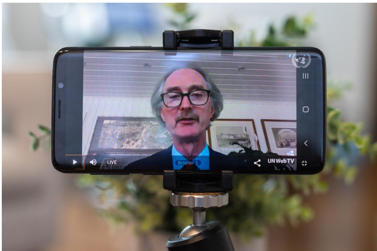
Syria: Special Envoy Geir O. Pedersen briefing the Security Council on the situation in Syria.

Brussels IV Conference: The Syria Team's engagement has ensured that the Conference reflects UN policy on Syria, including with regards to human rights, accountability and the political process led by Special Envoy Pedersen.