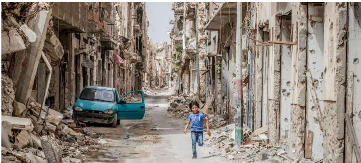
Libya: A child runs through the debris and wreckage in downtown Benghazi, Libya.

In the context of the Libya peace process, UNSMIL is facilitating three separate tracks of intra-Libyan discussions: security, political and economic. MSU assisted UNSMIL in its process of adaptation to the restrictions on direct diplomacy imposed by the COVID-19 pandemic and need to use digital tools to convene the virtual meetings of the intra-Libya talks and the Berlin International Follow-up Committee on Libya and its working groups. With the assistance of an external expert, MSU provided support in the area of digital process design and facilitation. Over the course of a three-week period in June, participants in the training exercise discussed preliminary options and the required skills in the context of the three main tracks of the Libyan process and agreed to continue working together to develop specific proposals and digital designs. As a result, the UNSMIL security team introduced and adopted various technological tools and techniques in the facilitation of the security track, under the umbrella of the 5+5 Joint Military Commission. In parallel, UNSMIL's political team continues to explore concrete options to promote dialogue among and engage the participants in the political track, including the Libyan Political Forum, using instant messaging systems and other digital platforms.