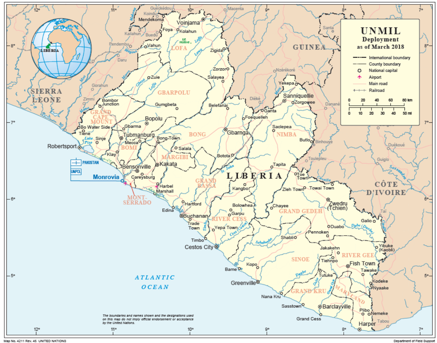
Geospatial Information Section (formerly Cartographic Section)